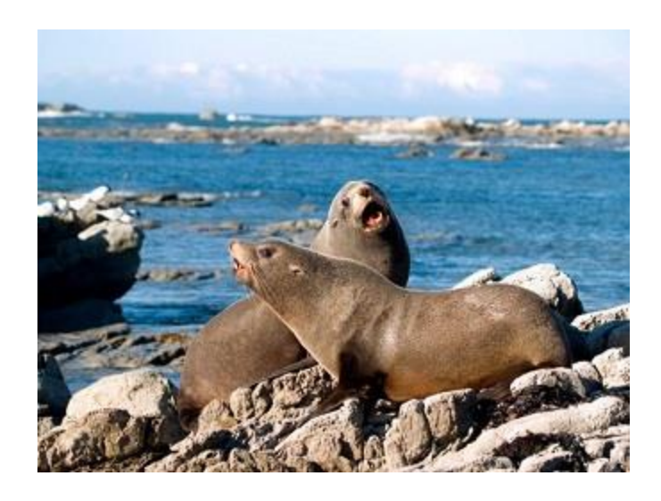
4 PM - 5 PM Part of New Zealand's Fiorland National Park, Dusky Sound was long the site of Maori camps but few permanent settlements. Captain Cook spent five weeks exploring the dramatic coastline that edges the mountainous wilderness.