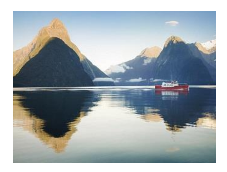
8:30 Am - 9:30 AM The Maori believed a divine mason carved Milford Sound. The fjord is a geological wonder of the ice age, where waterfalls cascade over sheer cliffs into the dark waters below and mountains dominated by Mitre Peak reach toward the sky.