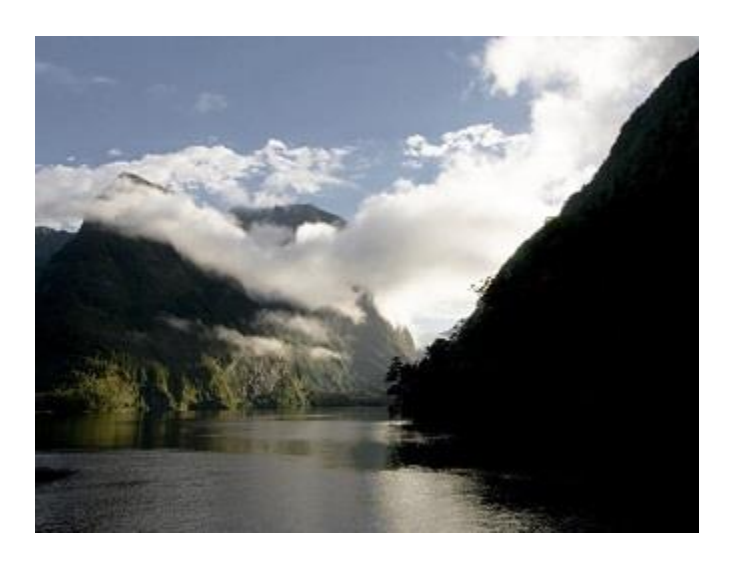
1 PM - 2 PM You can only experience the grand scenery and tranquility of this magnificent fjord by boat. Doubtful Sound sustains an amazing array of wildlife. In the rainy season, its steep hills are covered with hundreds of waterfalls.